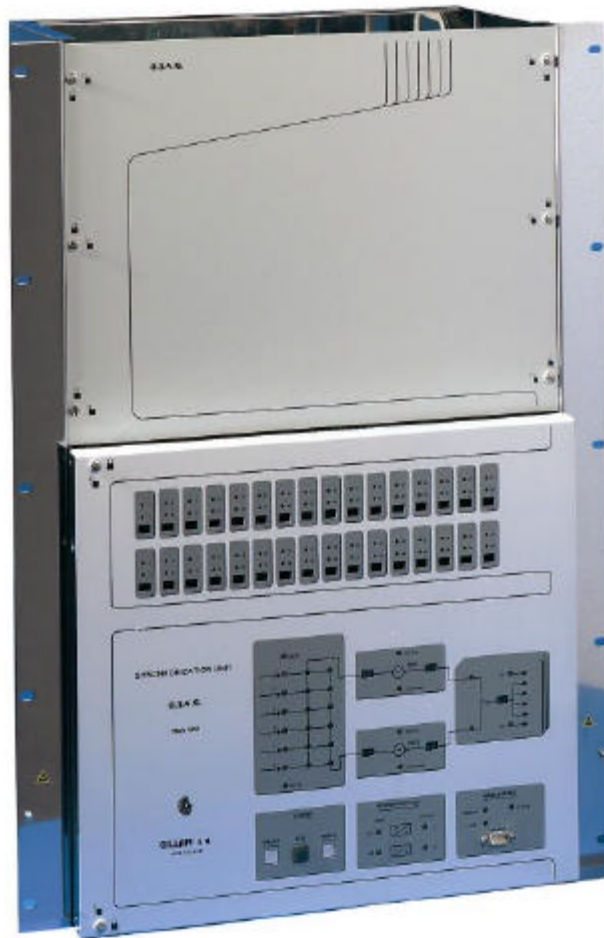
Figure 2 : US4G main unit front panel